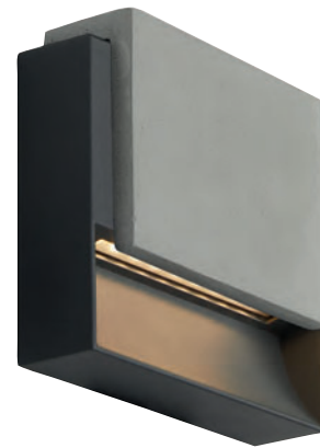
Galia Mini fitted with Concrete cover option