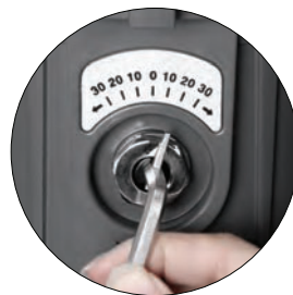
Adjustable 30° beam angle