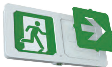
Rotatable legend design allows for selection of direction