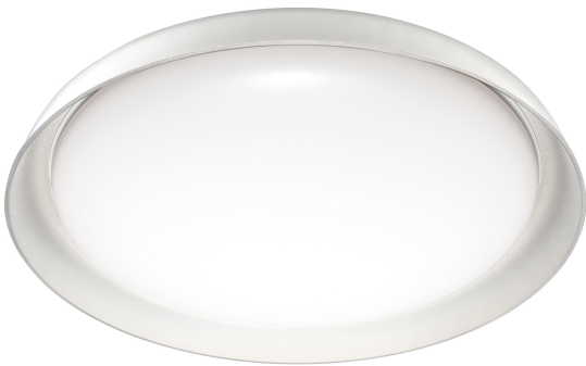
Plate | Decorative ceiling luminaires with WiFi technology