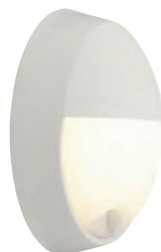
White - Eyelid PIR