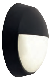
Black - Eyelid