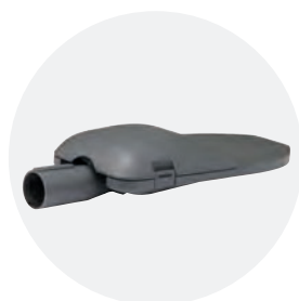
Adjustable 48-60mm Spigot bracket