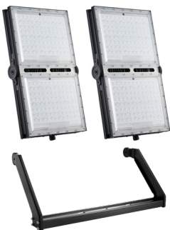
■ 4 modules, 1240W