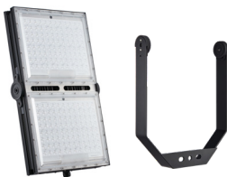
■ 2 modules, 620W