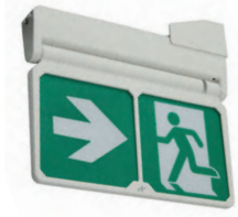
Side Arm Wall Mounting