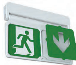
Rotatable legend design allows for selection of direction