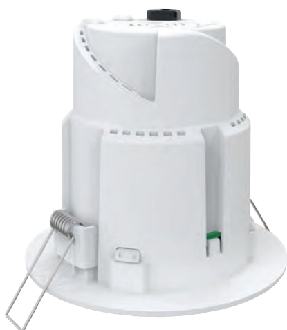
Emergency downlight with integral inverter and battery pack